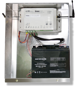
Clean designed control box means simple repairs

Should K&K not have a system that meets your needs, we will custom design a system to meet your specifications