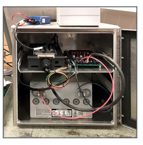
Competitor's control box.

Should K&K not have a system that meets your needs, we will custom design a system to meet your specifications